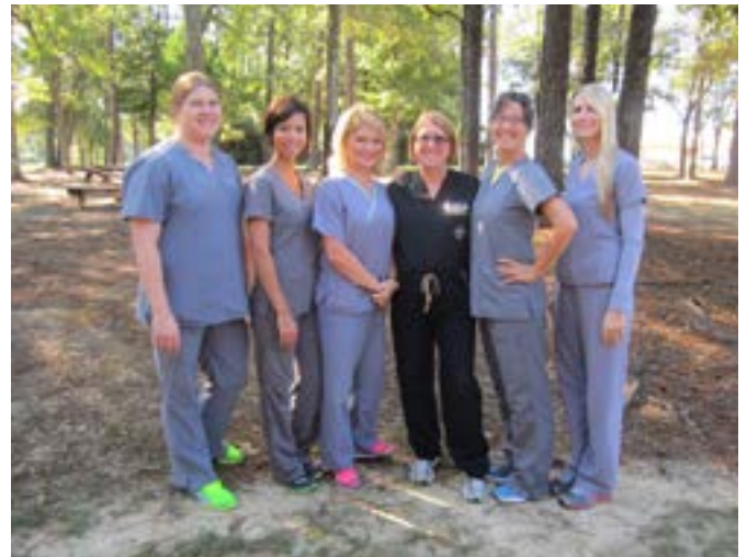
The Rehabilitation Fall Festival was a marvelous success by putting the FUN in FUNCTIONAL!! Thanks to our great therapy team!

Woodland Village Nursing Center invites you to join us for our Christmas party Dec. 12. There will be tons of entertainment, food and a visit from Santa!