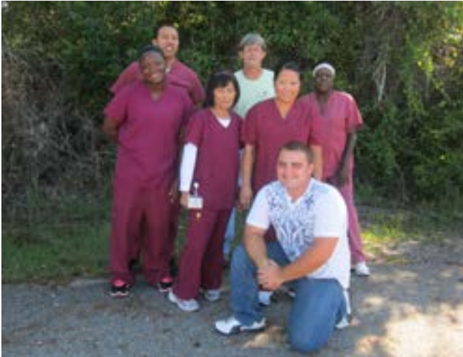
Thanks for keeping us safe and shining!