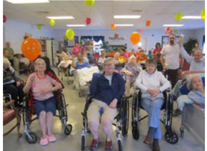
The Rehabilitation Fall Festival was great! We celebrated with special events that included dart balloons, ring toss, "reacher" duck dynasty, sharp shooter, fall crafts and rocket balloon. The snacks were funnel cake and popcorn.